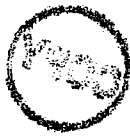
Exhibit A Scope of Work