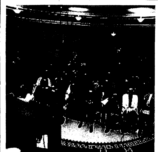
2004 Opening of the San Mateo History Museum Exhibit, "San Mateo County Women's Hall of Fame"