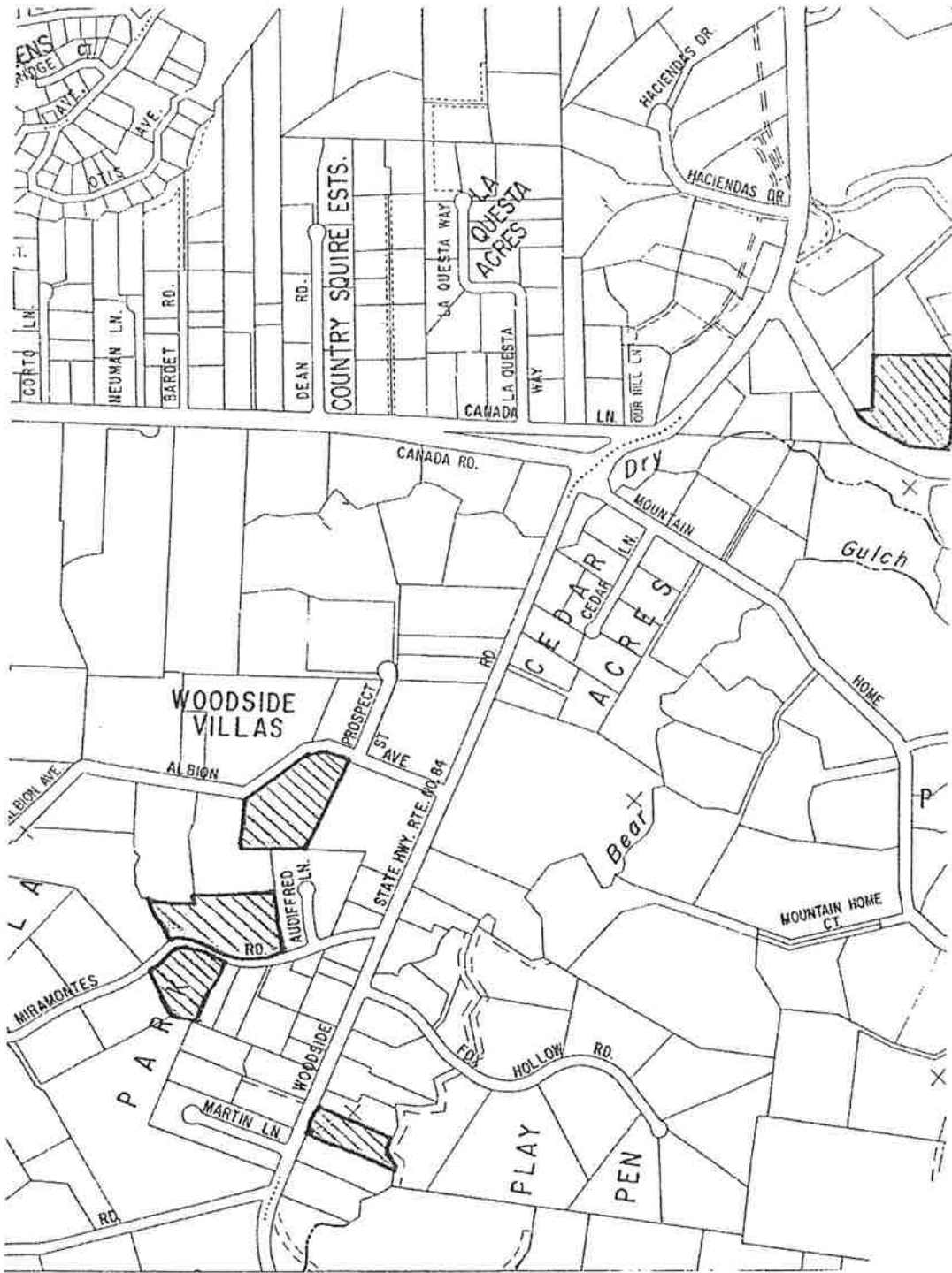
EXHIBIT B PARCELS ANNEXED TO THE TOWN CENTER SEWER ASSESSMENT DISTRICT TOWN OF WOODSIDE