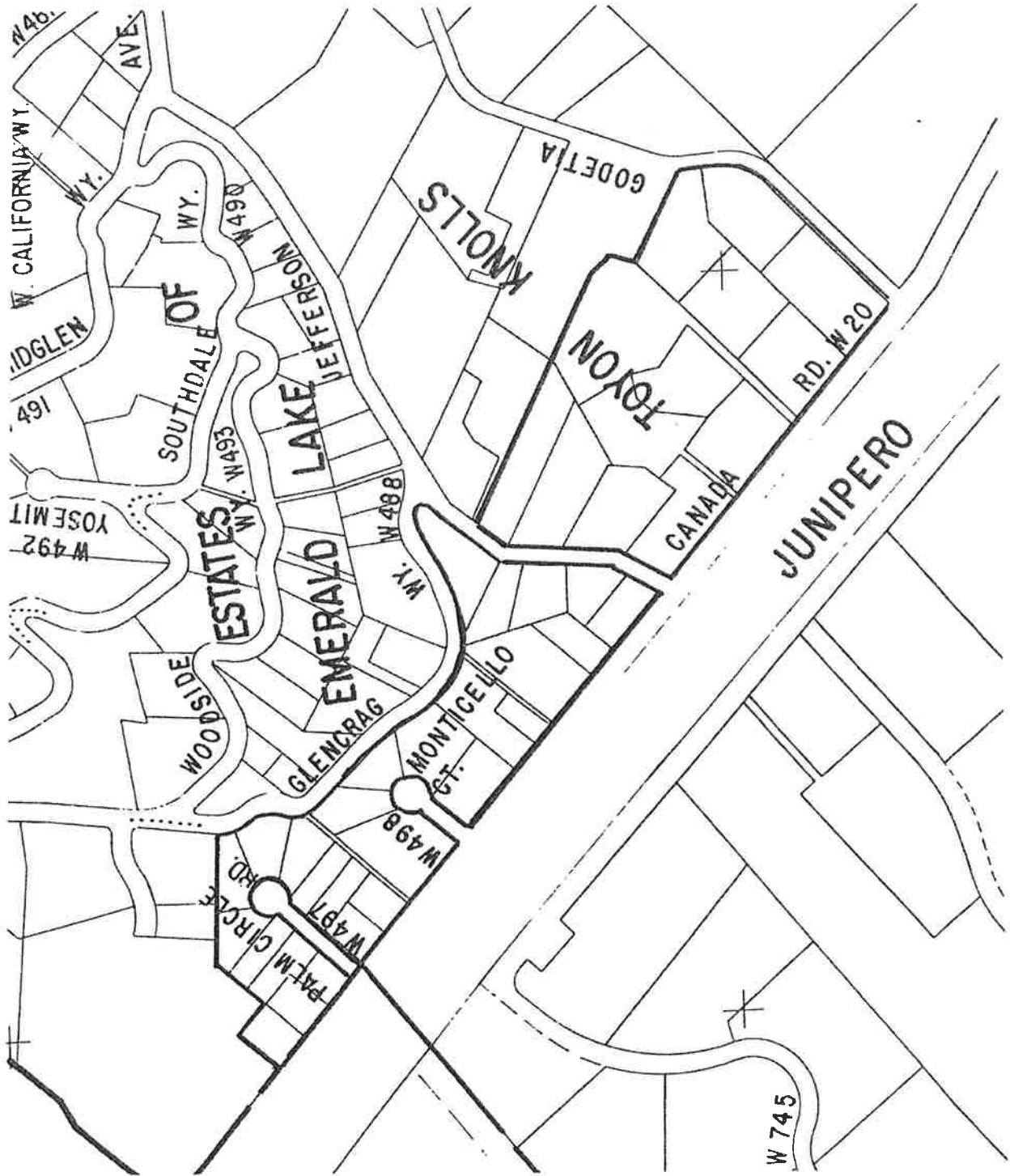
EXHIBIT A-2 TOWN CENTER SEWER ASSESSMENT DISTRICT - EXPANSION AREA TOWN OF WOODSIDE