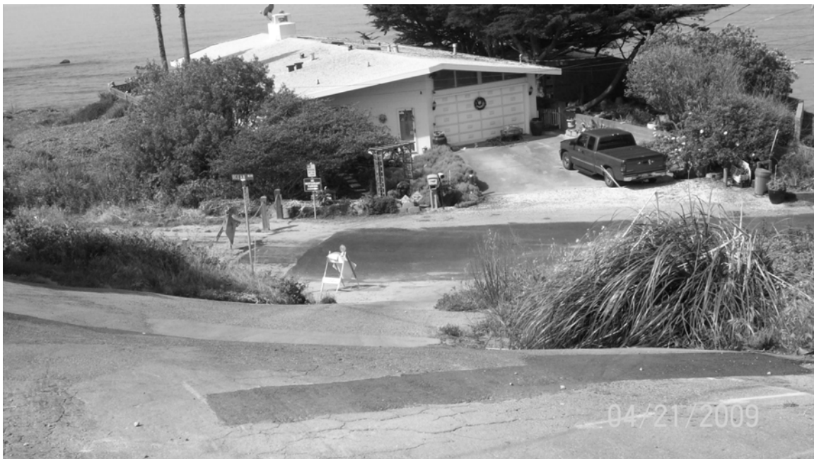
View of Ocean Boulevard from Southbound Los Banos Avenue