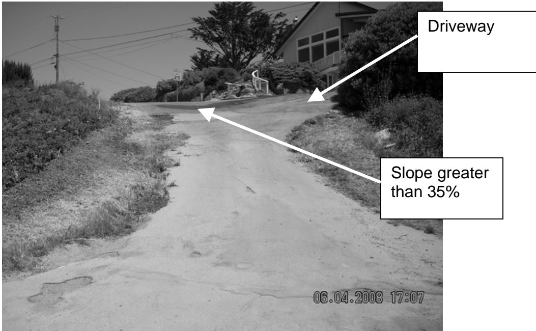
View of Los Banos Avenue from Ocean Boulevard