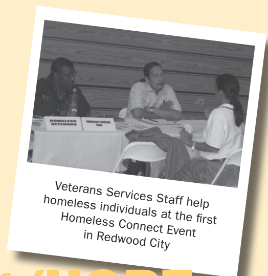
Veterans Services Staff help homeless individuals at the first Homeless Connect Event in Redwood City